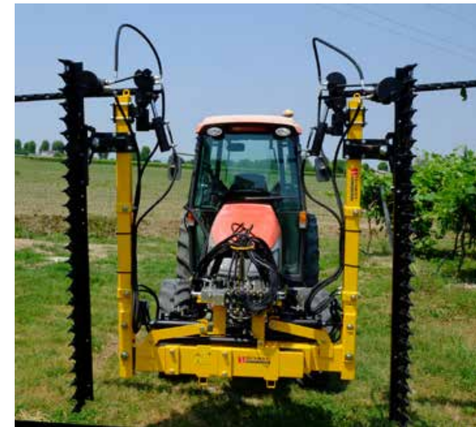
Models available for vineyards