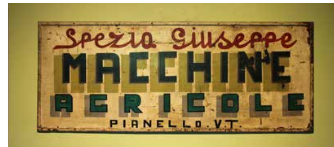
Historical sign dated 1949